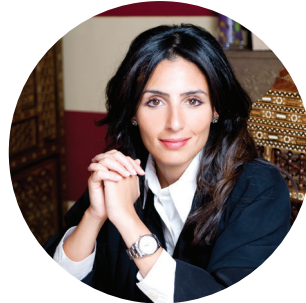
H.E. Razan Khalifa Al Mubarak High-Level Climate Action Champion, UNFCCC's COP28